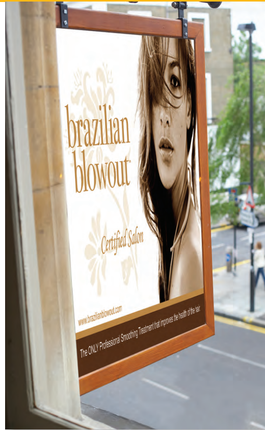
Outdoor sign on .030 durable styrene plastic, inserted in a frame

Our state-of-the-art technology can handle both rigid and flexible substrates. We print on almost any material less than two inches thick—including vinyl, PVC, foam board, wood, plastic, tile, and light metals—and up to 96 inches wide. And, with our UV-curing ink system, your graphics stay crisp and clear, even under the harshest weather conditions.