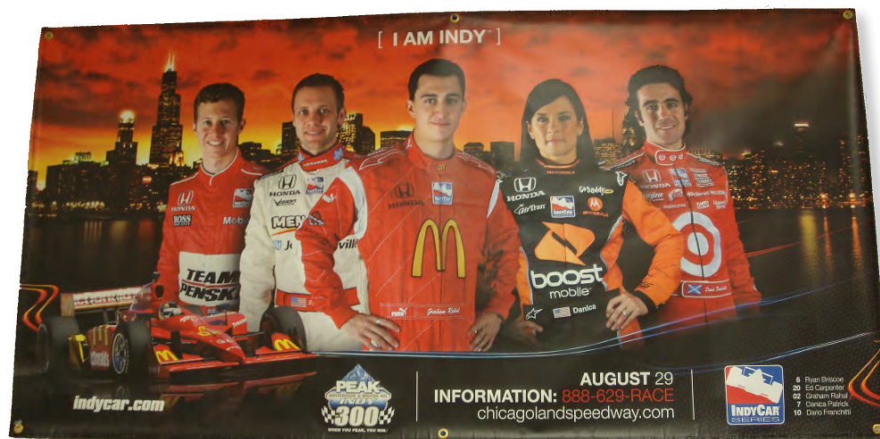
Strong but lightweight indoor banners on 10 ounce scrim vinyl

Our routing capabilities produce a vast array of precision-cut graphics.