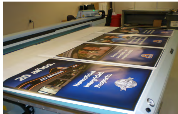
Posters printed by Fuji Acuity Advance held in place by Vacuum Flat Top for a full bleed

We can store your stock, track your inventory, alert you at re-ordering points, and deliver your products worldwide. Got a job with multiple steps and layers? No problem, we can handle the kitting and assembly for you.