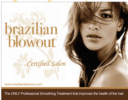
Low-cost window graphic with a low tack, pressure-sensitive adhesive that is repositionable, removable, and may be reapplied to most surfaces.

If sustainability is important to you, we will advise you on the environmental impact of the materials you are considering to use for your large format graphics.