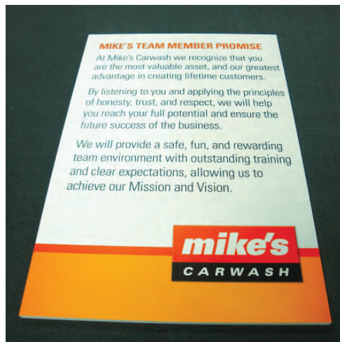
Attractive, durable indoor-outdoor sign made of 1/2 inch PVC board