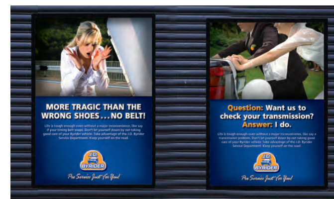
Indoor-outdoor signs made on poster paper and inserted in frames