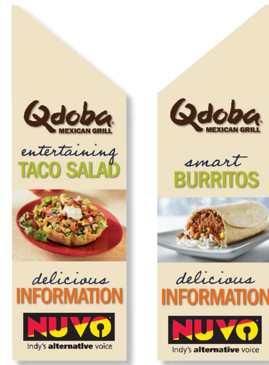
Economical retail wall displays on 3/16 inch ultra board