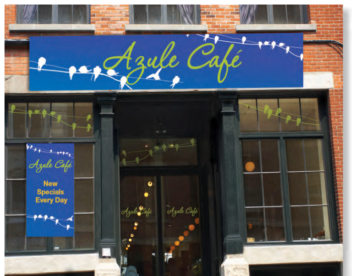
Horizontal and vertical outdoor banners on 13 ounce scrim vinyl, double stitched for extra durability and with grommets

Our routing capabilities produce a vast array of precision-cut graphics.