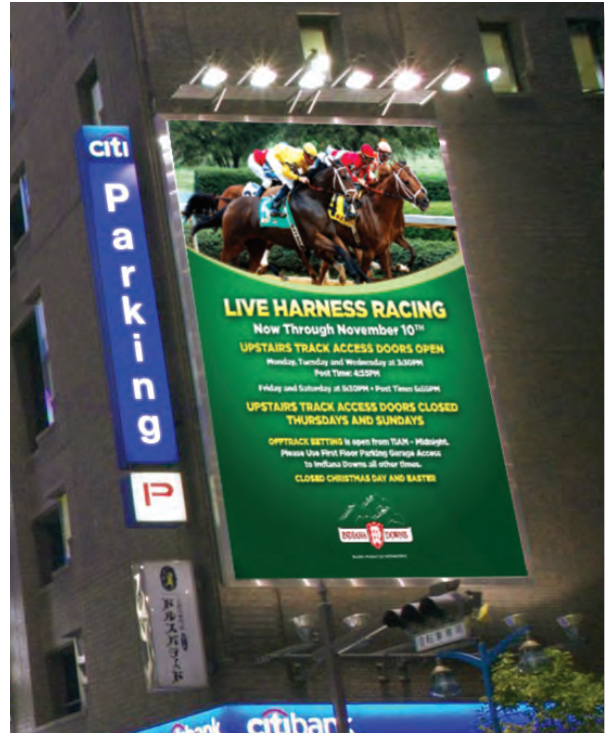
Outdoor sign on mesh vinyl that provides 37% airflow increasing durability and resistance to tearing